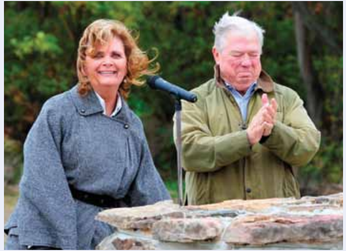
First Lady Marsha Barbour and Governor Haley Barbour address attendees at the Sky Lake Boardwalk opening ceremony.

The ceremony began at the Sky Lake amphitheater.